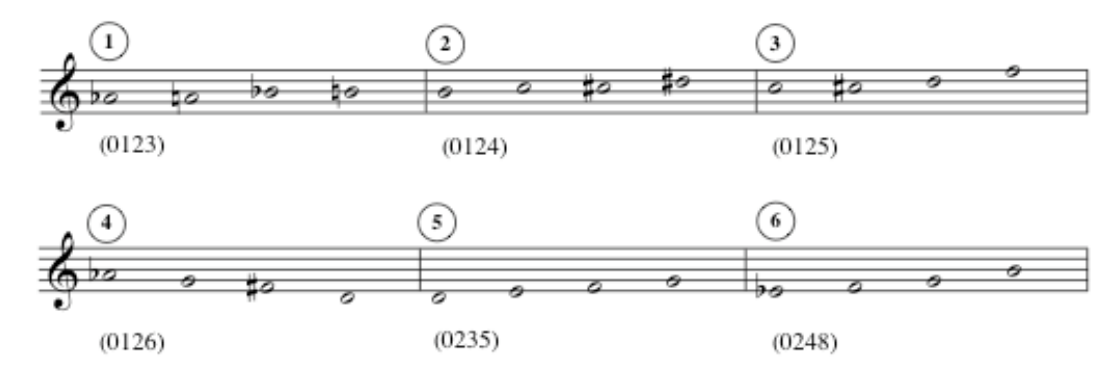
Figure 1. Tetrachords of Breadths of Topaz

The predominance of semitones in these collections stems from a desire to match the sound of the vibraphone part with the rich harmonic structure of the gongs. The gongs used in this piece, with the possible exception of the bao at softer dynamics, tend to produce many complex overtones which somewhat mask the fundamental pitch of the gong. The result is effectively a thick shimmering cluster of notes rather than a single clear pitch. The clusters of semitones found in most of the vibraphone's pitch material provide a means for the instrument to emulate this effect, allowing the vibraphone to connect to the sound world created by the gongs.